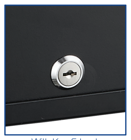
With Key & Lock (OPTIONAL)